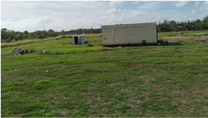
what is left of the cottage