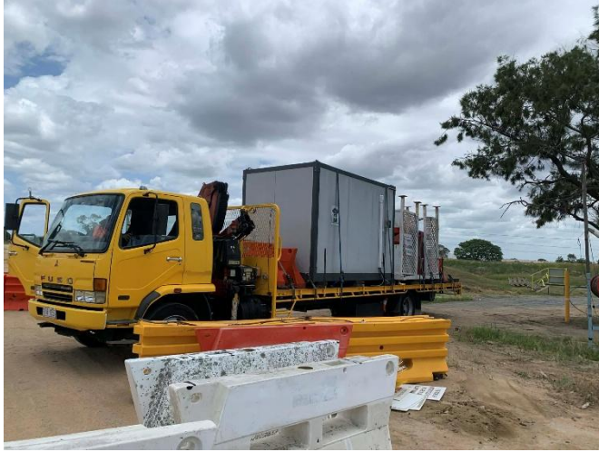
First to go to GCMX