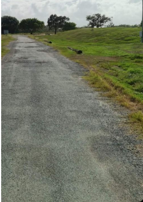
entry from front gate