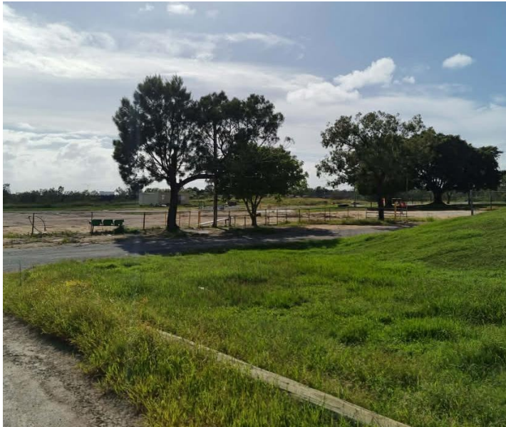
Water truck and Medical shed lane