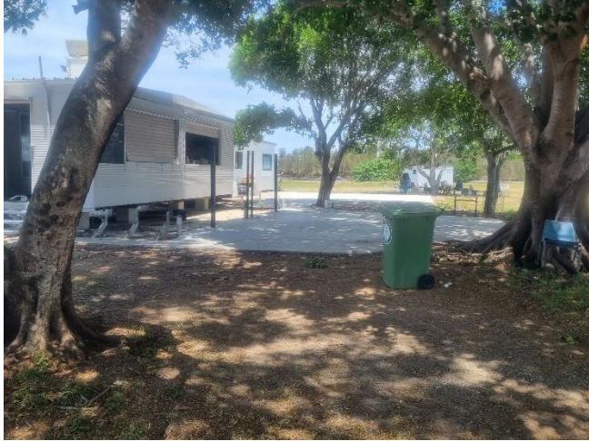
Club house and canteen roof off