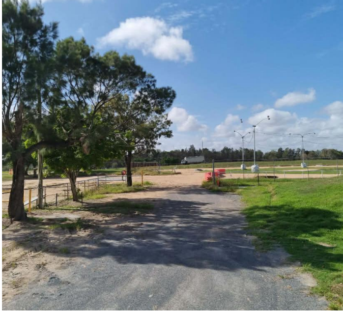
Entry to Track