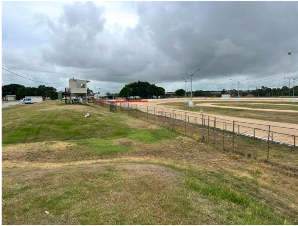
The Track after the Cup before work began.