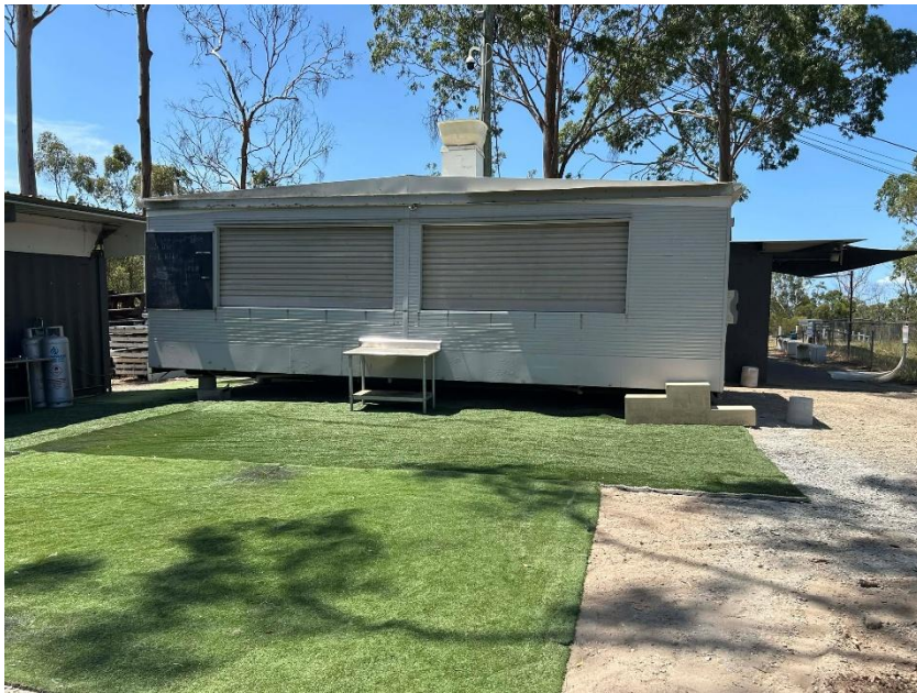
Canteen at GCMX