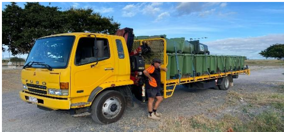
Bin on way to GCMX