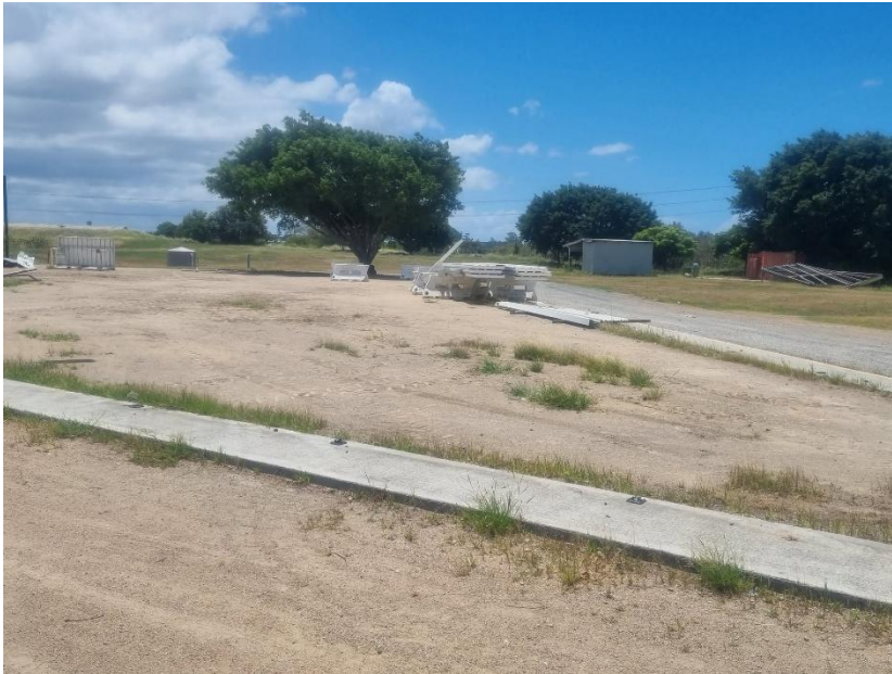
BMCC roofs off containers

16 th January – Removed roof of 2 BMCC containers still on site. General clean up of this area. Removal of sunshades and poles from both spectators' hills.