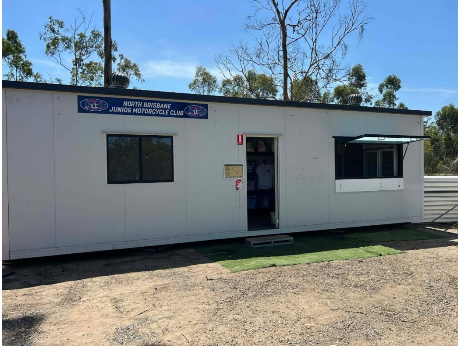
Club House at GCMX