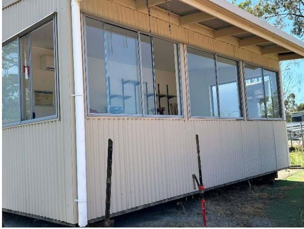
Tower at GCMX