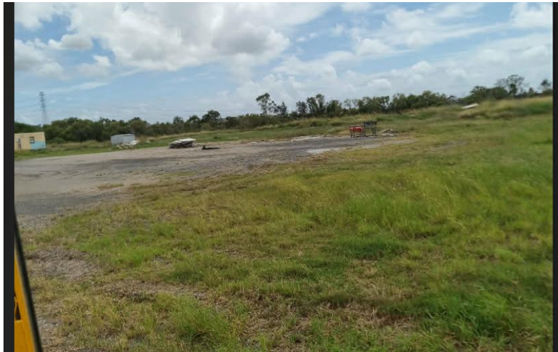
Looking across to cottage from inside pits

Official last meeting the 2026 North Brisbane Cup 6 th December 2025