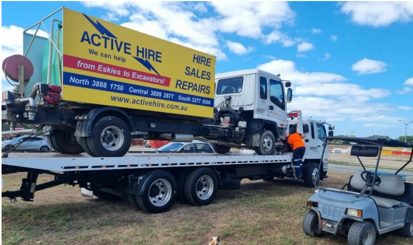
Water truck on way to Hatchers