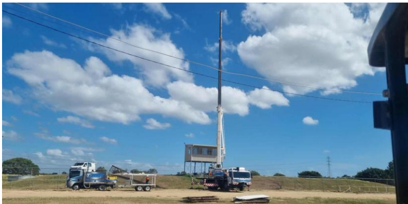
Tower coming down and off to GCMX