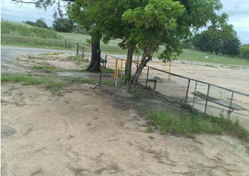
side of pits looking at start line