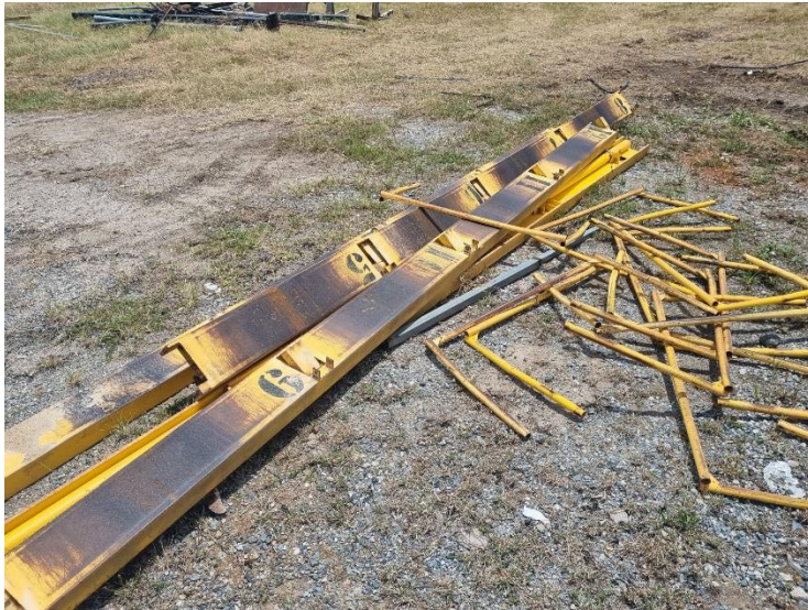
start gates down

2 x Scrap bins delivered today for removal of unwanted metal.