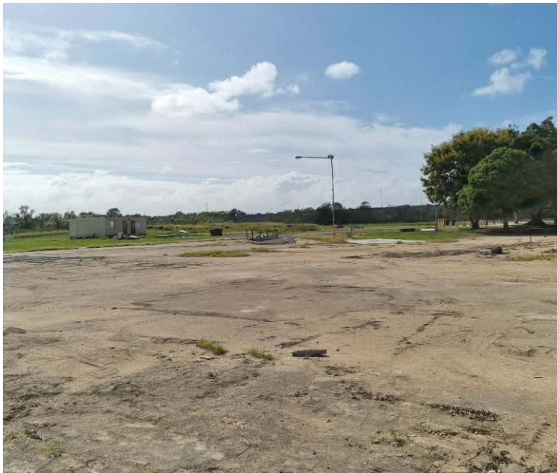
Looking from pit side gate to cottage