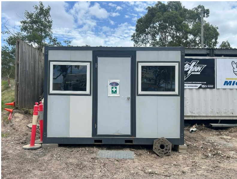
Medical Room at GCMX