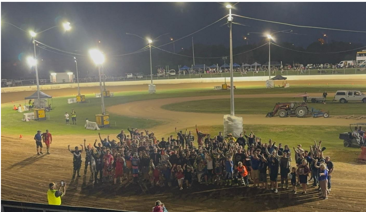
Members saying goodbye to the track at the North Brisbane Cup.

This is a very sad time for the club and the hard-working members that build this great venue, to what it became one of the best tracks in Australia. We can only say thanks to all that have put in their time and donations into building the Mick Doohan Raceway