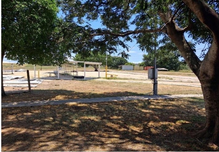
Pit area fence down