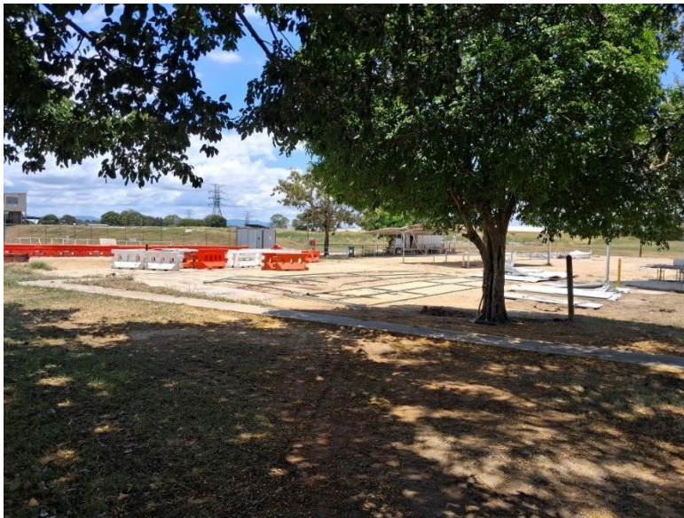
Pit Area pack up