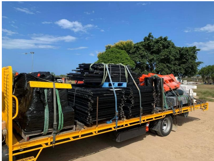
Pit fencing to GCMX