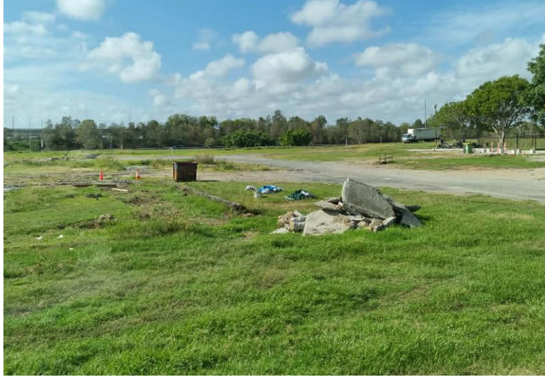
looking from pit entry to canteen and club house site